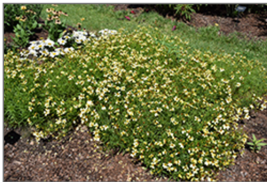
Candlelight Tickseed