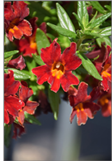
Mai Tai Red Monkeyflower flowers