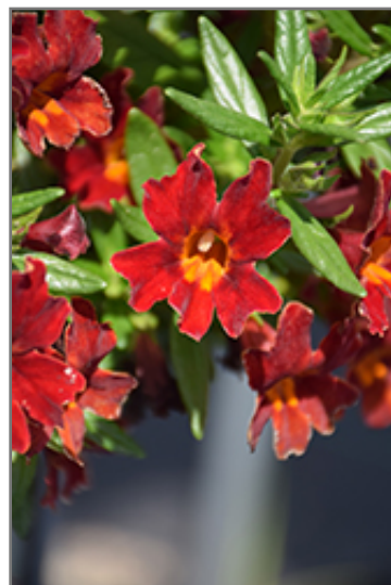
Mai Tai Red Monkeyflower flowers