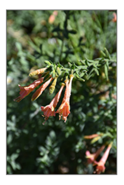
Marin Pink California Fuchsia flowers