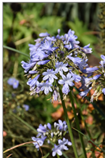
Charlotte Agapanthus flowers

Charlotte Agapanthus is recommended for the following landscape applications;