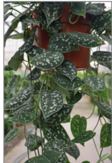
Argyraeus Pothos foliage