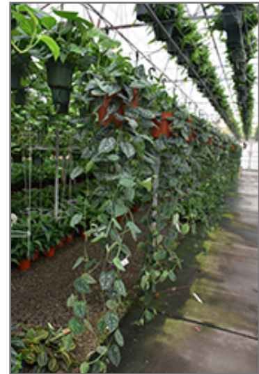
Argyraeus Pothos in full

There are many factors that will affect the ultimate height, spread and overall performance of a plant when grown indoors; among them, the size of the pot it's growing in, the amount of light it receives, watering frequency, the pruning regimen and repotting schedule. Use the information described here as a guideline only; individual performance can and will vary. Please contact the store to speak with one of our experts if you are interested in further details concerning recommendations on pot size, watering, pruning, repotting, etc.