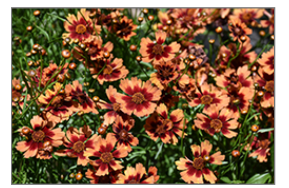
Desert Coral Tickseed flowers

Moana Lane Garden Center & Corporate Office South Virginia St. Garden Center 1100 W. Moana Lane Reno, NV 89509 (775) 825-0600 (775) 825-0602 - Corporate Office