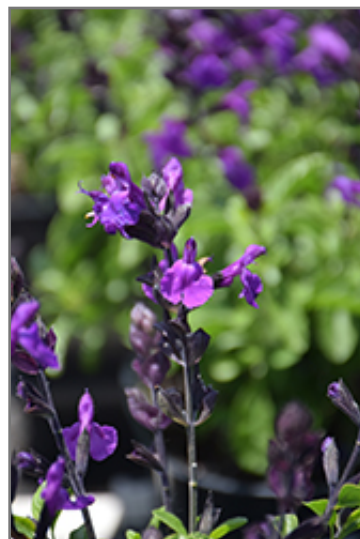
Mirage Violet Autumn Sage flowers

This is a relatively low maintenance plant, and should only be pruned after flowering to avoid removing any of the current season's flowers. It is a good choice for attracting bees, butterflies and hummingbirds to your yard, but is not particularly attractive to deer who tend to leave it alone in favor of tastier treats. It has no significant negative characteristics.