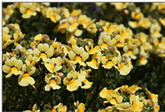
Nesia Inca Nemesia flowers