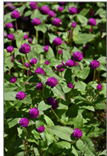
Pinball Purple Globe Amaranth flowers