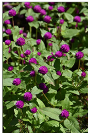
Pinball Purple Globe Amaranth flowers