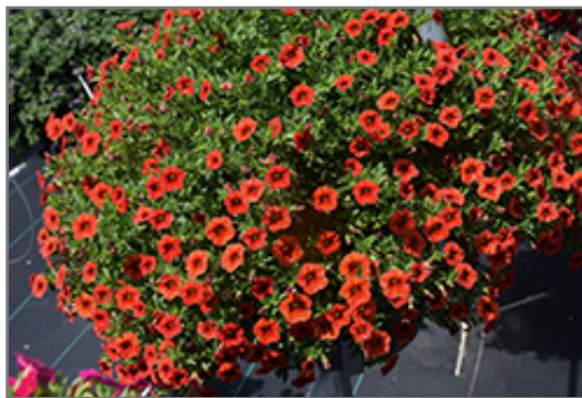
Cha-Cha Orange Calibrachoa in bloom