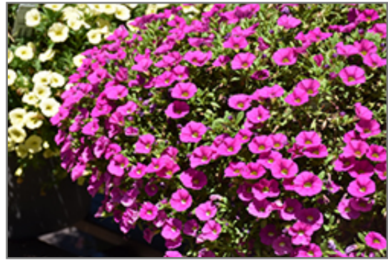
Cabaret Pink Calibrachoa flowers

Cabaret Pink Calibrachoa is recommended for the following landscape applications;