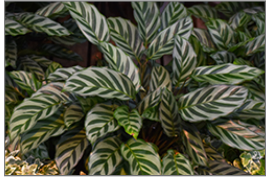
Color Full Makoyana Peacock Plant foliage

This is an herbaceous houseplant with an upright spreading habit of growth. Its relatively coarse texture stands it apart from other indoor plants with finer foliage. This plant should not require much pruning, except when necessary to keep it looking its best.