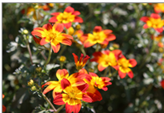
Bee Happy Red Bidens flowers