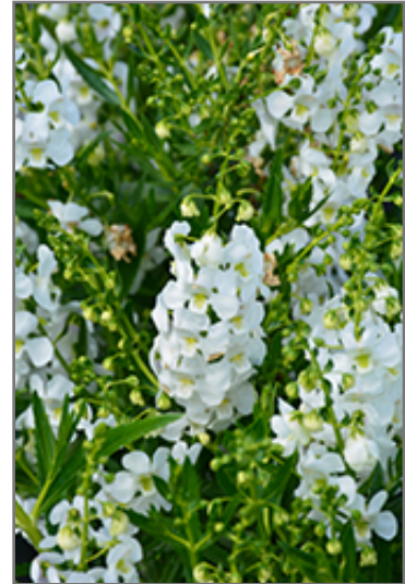
Angelwings White Angelonia flowers

Angelwings White Angelonia is recommended for the following landscape applications;