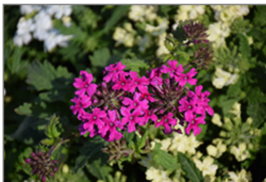
Homestead Hot Pink Verbena flowers