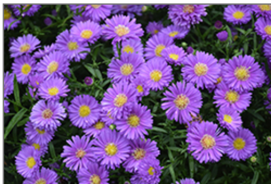
Magic Purple Aster flowers

Magic Purple Aster is recommended for the following landscape applications;