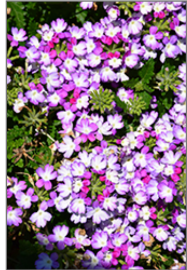
BeBop Lavender Verbena flowers

BeBop Lavender Verbena is recommended for the following landscape applications;