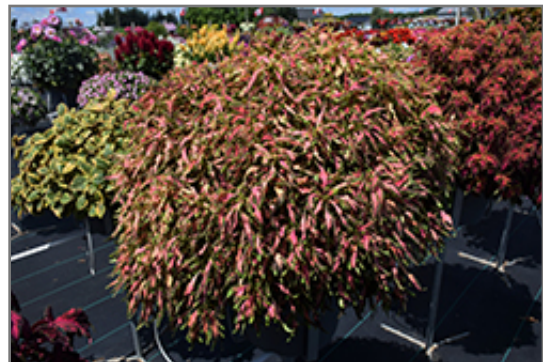
PartyTime Reggae Salmon Coleus