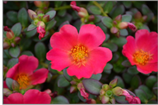
Cupcake Upright Magenta Portulaca flowers

Cupcake Upright Magenta Portulaca is recommended for the following landscape applications;