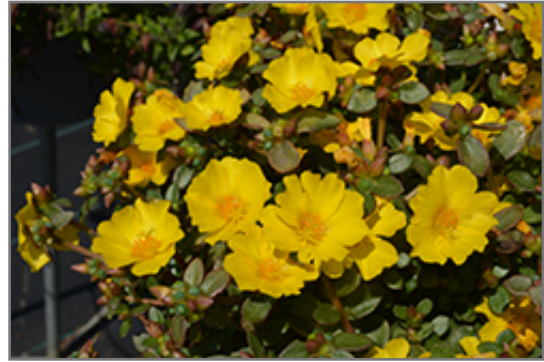
Cupcake Upright Lemon Zest Portulaca flowers

Cupcake Upright Lemon Zest Portulaca is recommended for the following landscape applications;