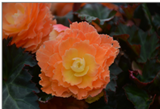
I'Conia Miss Miami Begonia flowers