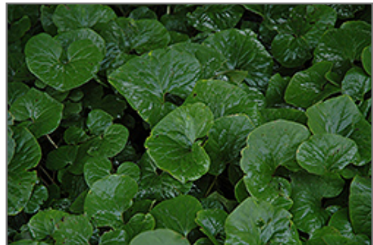
Canadian Wild Ginger

Moana Lane Garden Center & Corporate Office 1100 W. Moana Lane Reno, NV 89509 (775) 825-0600 (775) 825-0602 - Corporate Office