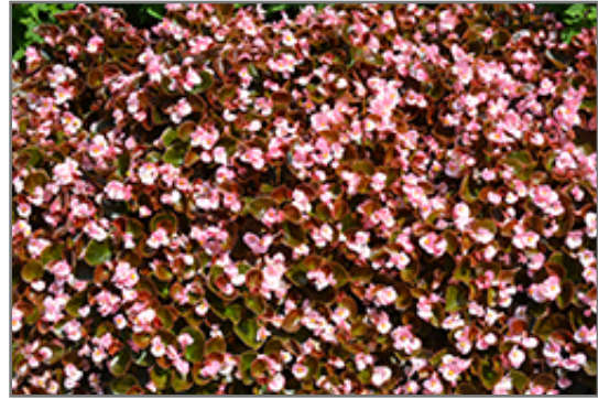
Cocktail Brandy Begonia flowers

Cocktail Brandy Begonia is a fine choice for the garden, but it is also a good selection for planting in outdoor containers and hanging baskets. It is often used as a 'filler' in the 'spiller-thriller-filler' container combination, providing a mass of flowers and foliage against which the thriller plants stand out. Note that when growing plants in outdoor containers and baskets, they may require more frequent waterings than they would in the yard or garden.