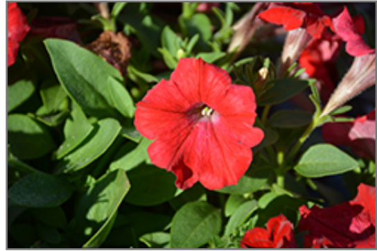
Whispers Red Petunia flowers

This plant will require occasional maintenance and upkeep. Trim off the flower heads after they fade and die to encourage more blooms late into the season. It is a good choice for attracting butterflies and hummingbirds to your yard, but is not particularly attractive to deer who tend to leave it alone in favor of tastier treats. It has no significant negative characteristics.