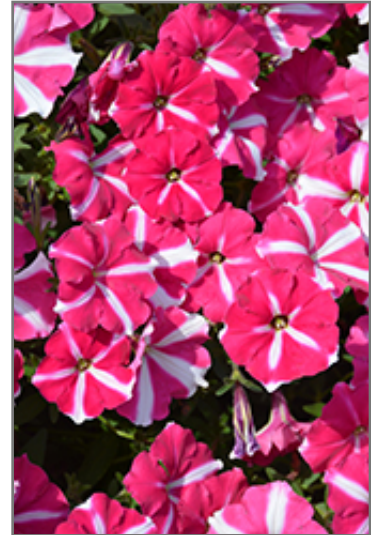
Hurrah Rose Star Petunia flowers

Hurrah Rose Star Petunia is recommended for the following landscape applications;