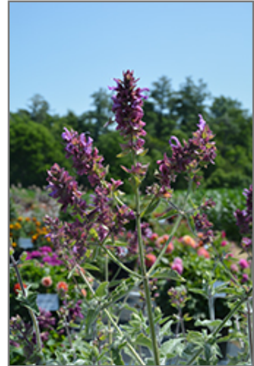
Lancelot Canary Island Sage flowers

Lancelot Canary Island Sage is an herbaceous annual with an upright spreading habit of growth. Its relatively fine texture sets it apart from other garden plants with less refined foliage.