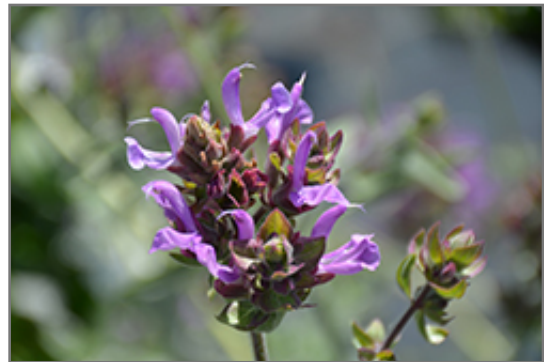
Lancelot Canary Island Sage flowers