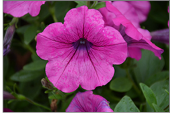
Opera Supreme Purple Petunia flowers

Opera Supreme Purple Petunia is recommended for the following landscape applications;