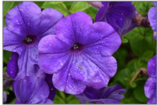
Opera Supreme Blue Petunia flowers

Opera Supreme Blue Petunia is recommended for the following landscape applications;