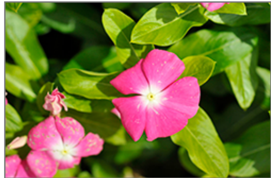
Pacifica XP Rose Halo Vinca flowers

This plant will require occasional maintenance and upkeep, and should not require much pruning, except when necessary, such as to remove dieback. It is a good choice for attracting butterflies to your yard, but is not particularly attractive to deer who tend to leave it alone in favor of tastier treats. It has no significant negative characteristics.