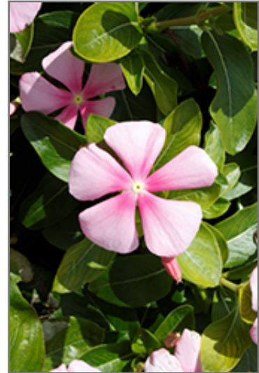
Pacifica XP Icy Pink Vinca flowers

Pacifica XP Icy Pink Vinca is recommended for the following landscape applications;