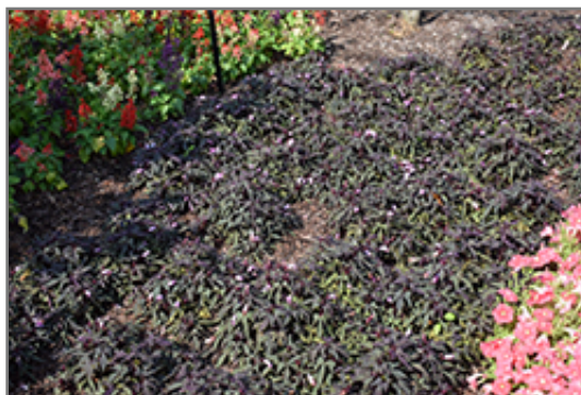
FloraMia Nero Sweet Potato Vine in bloom

FloraMia Nero Sweet Potato Vine will grow to be about 8 inches tall at maturity, with a spread of 24 inches. When grown in masses or used as a bedding plant, individual plants should be spaced approximately 20 inches apart. Its foliage tends to remain low and dense right to the ground. This fast-growing annual will normally live for one full growing season, needing replacement the following year.