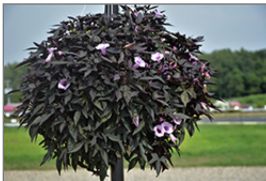
FloraMia Nero Sweet Potato Vine