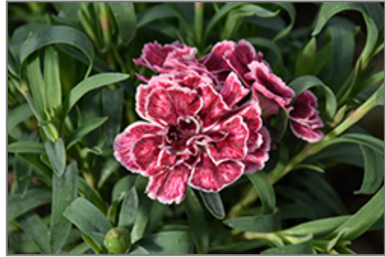
Constant Beauty; Crush Burgundy Pinks flowers

This is a relatively low maintenance plant, and is best cleaned up in early spring before it resumes active growth for the season. It is a good choice for attracting bees and butterflies to your yard, but is not particularly attractive to deer who tend to leave it alone in favor of tastier treats. It has no significant negative characteristics.