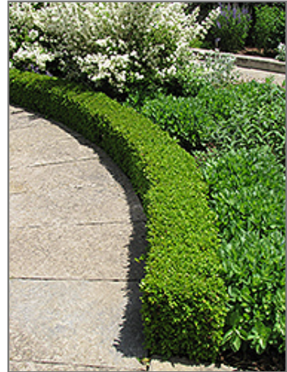
Green Velvet Boxwood

Green Velvet Boxwood makes a fine choice for the outdoor landscape, but it is also well-suited for use in outdoor pots and containers. Because of its height, it is often used as a 'thriller' in the 'spiller-thriller-filler' container combination; plant it near the center of the pot, surrounded by smaller plants and those that spill over the edges. It is even sizeable enough that it can be grown alone in a suitable container. Note that when grown in a container, it may not perform exactly as indicated on the tag - this is to be expected. Also note that when growing plants in outdoor containers and baskets, they may require more frequent waterings than they would in the yard or garden.