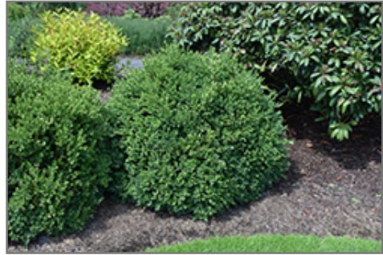
Green Velvet Boxwood