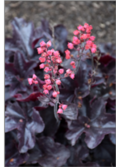
Black Forest Cake Coral Bells flowers

Black Forest Cake Coral Bells is recommended for the following landscape applications;