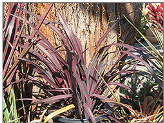
Dark Delight New Zealand Flax