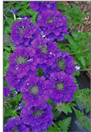
Samira Deep Blue Verbena flowers

Samira Deep Blue Verbena is recommended for the following landscape applications;