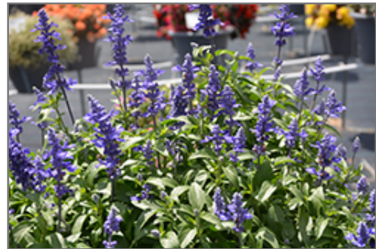
Icon Dark Blue Salvia in bloom

Moana Lane Garden Center & Corporate Office 1100 W. Moana Lane Reno, NV 89509 (775) 825-0600 (775) 825-0602 - Corporate Office