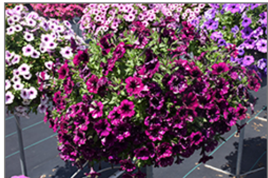
Splash Dance Magenta Mambo Petunia in bloom