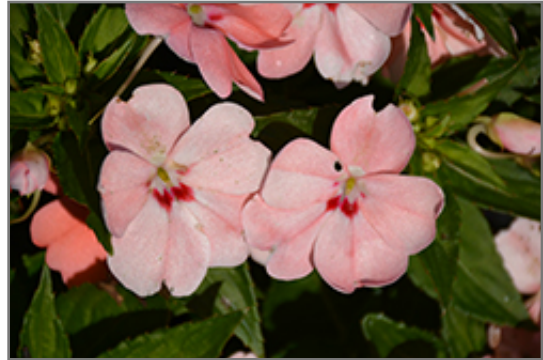
SunStanding Spot On Salmon Impatiens flowers

SunStanding Spot On Salmon Impatiens is recommended for the following landscape applications;