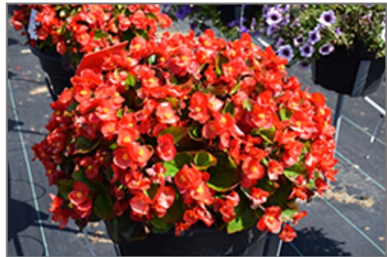
Super Cool Red Begonia in bloom