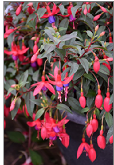
Army Nurse Fuchsia flowers