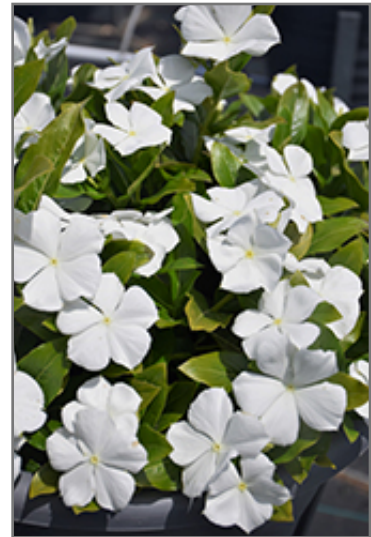
Cora Cascade White Vinca flowers

Cora Cascade White Vinca is recommended for the following landscape applications;