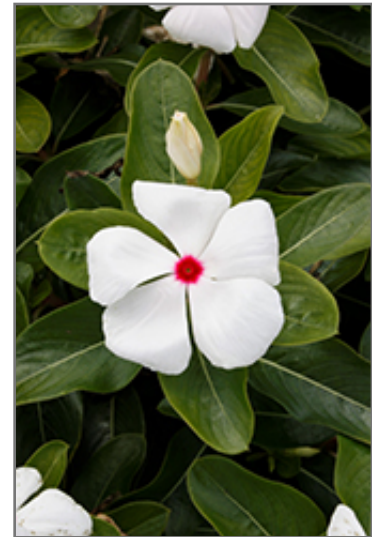
Cora Cascade Polka Dot Vinca flowers

Cora Cascade Polka Dot Vinca is recommended for the following landscape applications;