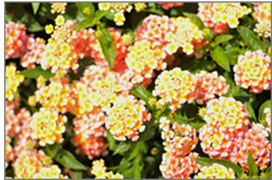
Lucky Peach Lantana flowers

Lucky Peach Lantana is recommended for the following landscape applications;