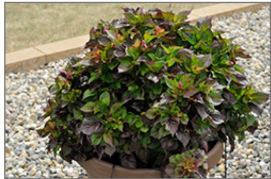
Sol Gekko Green Celosia