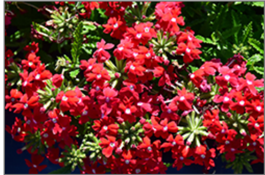
Obsession Cascade Red with Eye flowers

Obsession Cascade Red with Eye is recommended for the following landscape applications;