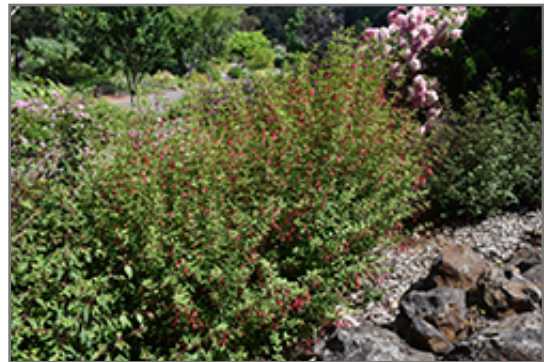
Thompsonii Hardy Fuchsia in bloom