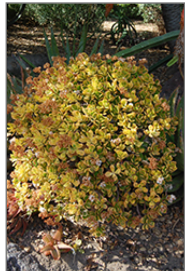
Hummel's Sunset Golden Jade Plant in bloom

Moana Lane Garden Center & Corporate Office 1100 W. Moana Lane Reno, NV 89509 (775) 825-0600 (775) 825-0602 - Corporate Office