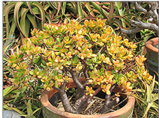
Sunset Jade Plant