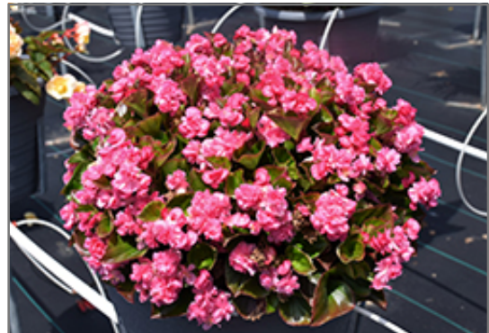
Double Up Pink Begonia in bloom

Moana Lane Garden Center & Corporate Office 1100 W. Moana Lane Reno, NV 89509 (775) 825-0600 (775) 825-0602 - Corporate Office